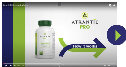
Atrantil PRO – How it Works