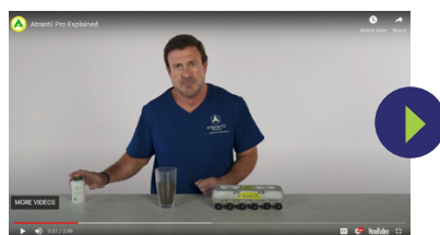
Atrantil PRO explained